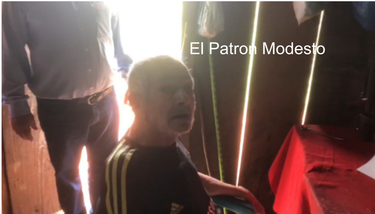
El Patron Modesto