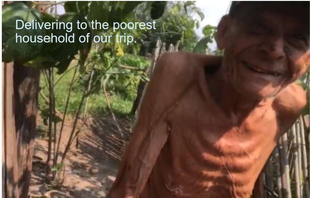
Delivering to the poorest household of our trip.