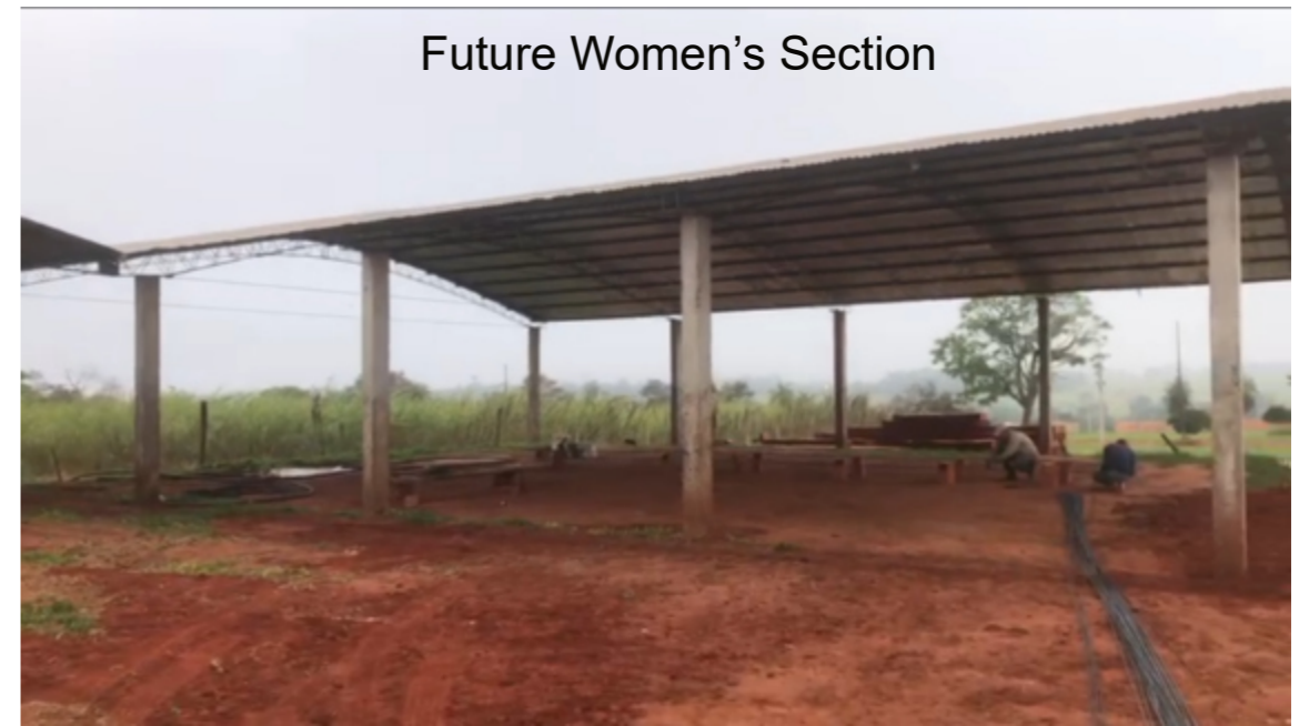
Future Women's Section