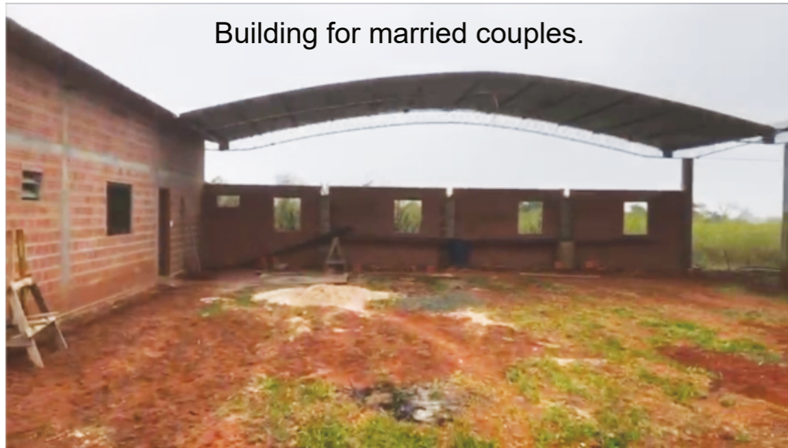
Building for married couples.